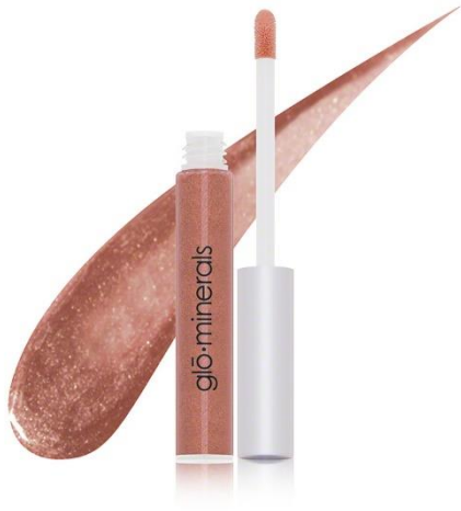
(glo-minerals Brown Sugar)